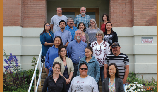
The Land & Resources and CCRIFIC Teams

Ktunaxa Lands and Resource Agency 7468 Mission Road, Cranbrook, BC V1C7E5 Office: 250-489-2464 Toll Free: 1-800-324-4118