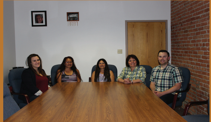
The Economic Sector Team