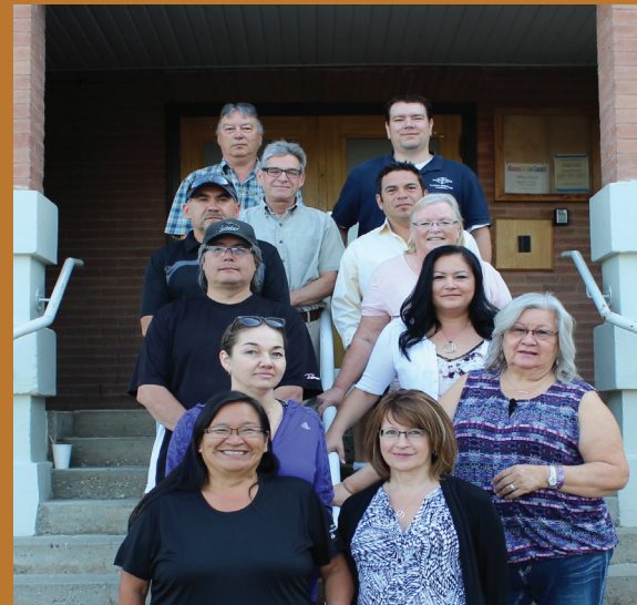
The Core Services Team

We continue to use our website, Ktunaxa.org as well as social media including Facebook and Twitter to get out as much news as possible. We know that not everyone uses social media, so we will continue to use other ways including posters and other physical media to get news and information into the hands of Ktunaxa Citizens.