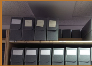
After

In January 2016 we began a Records and Information Management project with the entire Nation Council. This initiative is expected to take three years for completion and will result in a fully electronic catalogue of Ktunaxa Records and Information including the cultural resource materials stored in archives. Training will be provided for all Nation Staff to ensure comprehensive understanding of this new information system.